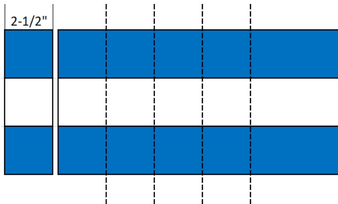
Strip Set C Diagram 9